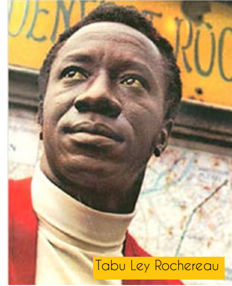
Tabu Ley Rochereau