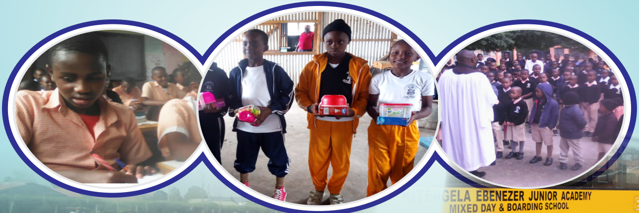
KITENGELA EBENEZER JUNIOR ACADEMY MIXED DAY & BOARDING SCHOOL

We are a mixed Day and Boarding Primary School located at Baraka Road, New Valley at a Serene Environment in a low Housing Area.