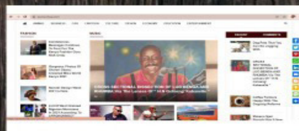
2. Sichwa Post - www.post.sichwa.com