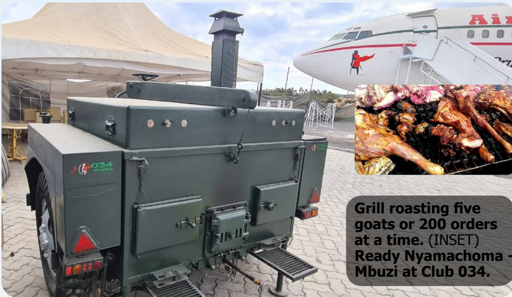
Grill roasting five goats or 200 orders at a time. (INSET) Ready Nyamachoma - Mbuzi at Club 034.

gether' session, it offers them a better opportunity as its accessibility will be a big boost.