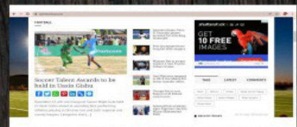
5. Sichwa Sports - www.sports.sichwa.com

Lenana Pharmaceutical Building, Opposite Equity Afya Medical Centre, Ground Floor, Office 12, Kitengela Town