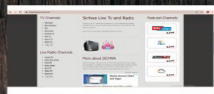
4. Sichwa Stream Live - www.streamlive.sichwa.com