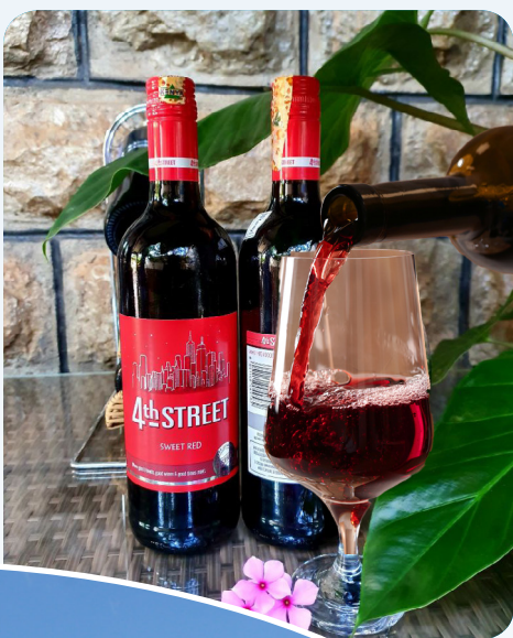
For affordable drinks.

The new facility will also offer direct employment to Kenyans to work as chefs and other hotel staff. "We will offer a ready market for farmers to supply us with eggs, milk, chicken, vegetables and other requirement," he said.