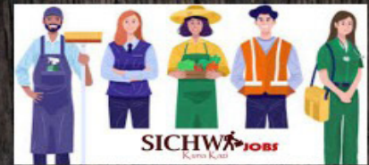
3. Sichwa Jobs - www.jobs.sichwa.com