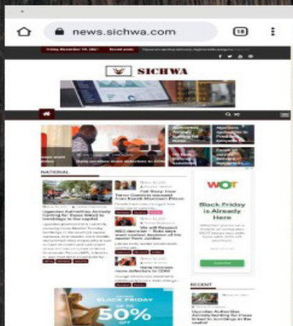
1. Sichwa News - www.news.sichwa.com